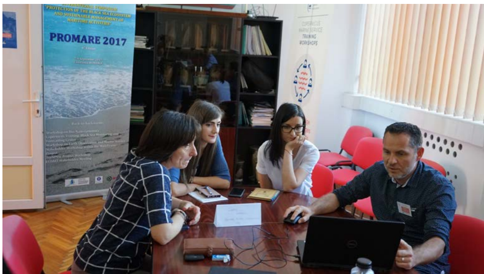
Fig. 6. Practical examples during with an interactive Speed Training (Copernicus Marine Service Training Workshop 2019 Black Sea).