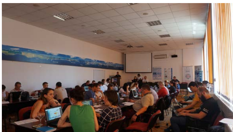
Fig. 1. Plenary session during Copernicus Marine Service Training Workshop 2019 Black Sea.

The theme for this Training Workshop was targeted to give participants detailed insight into the most relevant experimental methodology. Lectures on ecosystem and oceanographic modelling showed how local processes can be scaled up to regional scales. The training covered the main issues focused on: Black Sea Model Products (ocean currents, sea level, waves, chlorophyll-a); Satellite Ocean Color products; Satellite Wave Products; Satellite Sea Level Products; In Situ Products (CMEMS http://marine.copernicus.eu/services-portfolio/access-to-products/ ). The lectures on theoretical aspects were supplemented with dedicated practical applications in selecting, computing and using such tools (Fig. 1).