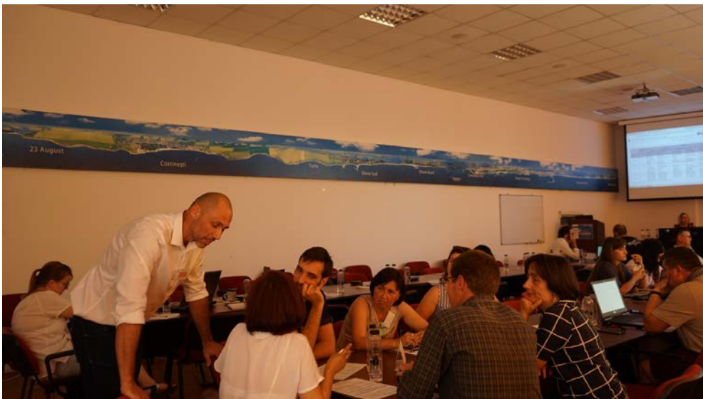
Fig. 4. Practical session during Copernicus Marine Service Training Workshop 2019 Black Sea.

Actually, the Practical Session by Service Desk CMEMS focused on Jupyter Notebook introduction, how to register and browse in the catalogue, and how to extract, visualize and download data examples and exercises were included, together with region specific applicability and future proposals.