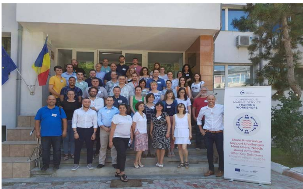
Fig. 7. Group Photo Copernicus Marine Service Black Sea Training Workshop (June 2019).