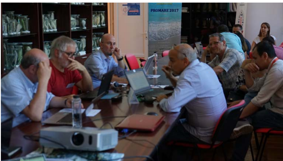
Fig. 5. Practical session during Copernicus Marine Service Training Workshop 2019 Black Sea.

Participants learned to search SeaLevel Satellite Observations data, to download a Level 4 product using the SubSet Download Service and Level 3 product using the DirectGetFile Service, to read a netCDF file and to plot the Copernicus SeaLevel Satellite Observations data, using Jupyter Notebook.