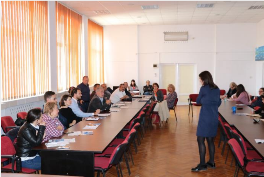
Fig. 2. Blue Growth Workshop debates with local stakeholders (30 th October 2018, NIMRD headquarter)

Generally, the main findings of the workshops were related to policies and underdevelopment. It was evidenced the excessive bureaucracy and authorities directly linked to lack of communication and the limitations of the local authorities and communities. Despite of many strategies, the area needs improvement and sustainable development involving infrastructure, social protection, health and education. Further, on 5 September 2019, the National Institute for Marine Research and Development “Grigore Antipa” Constanta, Romania (NIMRD) hosted a MAL meeting for the Danube’s Mouths - Black Sea Case Study, with the participation of partners from the Research Institute for Agriculture Economy and Rural Development (ICEADR), Local Activity Group Danube Delta (GAL DD) and Local Activity Group Central Dobrogea (GAL DC). The meeting was attended by local actors, representing municipalities, research institutions/academia, authorities, entrepreneurs and civil society, who all contributed to develop future narratives about the development of the region. There were two working groups and the main development directions identified in the area were eco-tourism, aquaculture (for the coastal and delta communities) and integrated agriculture (for inland rural areas) (Golumbeanu et al. , 2019).